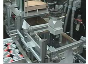
Sig. Ágústsson, Iceland