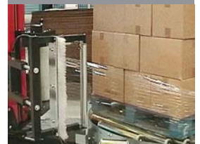
United Milk, United Kingdom