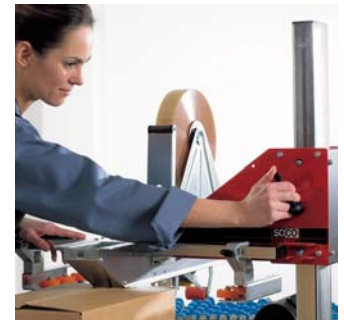
Setting a new case size is quick and easy.