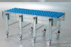
Flexi conveyors can be turned and extended to the desired position. The length can be varied from 1520 mm to 5350 mm.