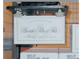
Bouché Père & Fils, France