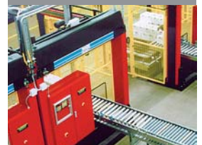
Altmark Käserei, Germany