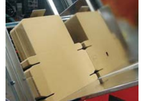
Geberit AG, Switzerland